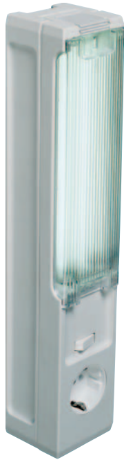
Lamp shown with protective plastic cover (see Accessories)